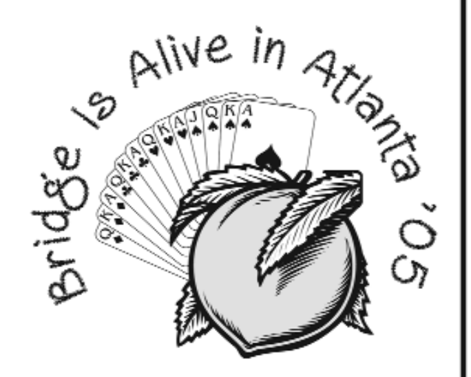
Look for our fliers on tournament information tables. And do yourself a favor: Bookmark www.mabcbridge.org

Three of the ACBL's six largest sectionals were in Atlanta last year. The success comes from following the proven Mid-Atlantic formula of player hospitality, a variety of events and guest speakers for Non-Life Masters, and knockouts galore. Share in the silver point bonanza at our Memorial Day SuperSectional, May 26-30. The host hotel, the Hilton Atlanta Northeast, (770-447-4747) offers a $65 bridge rate.