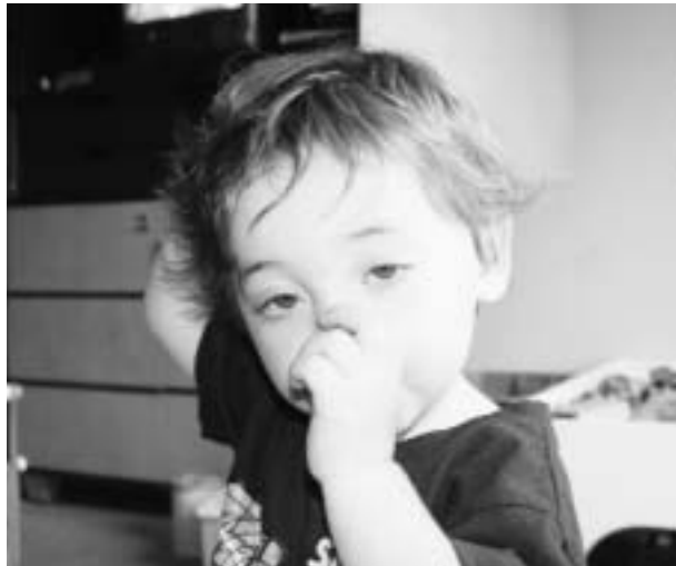
"I can make it if trumps are 3-3 and the king is onside." A future player poses for the camera at the NABC child care.