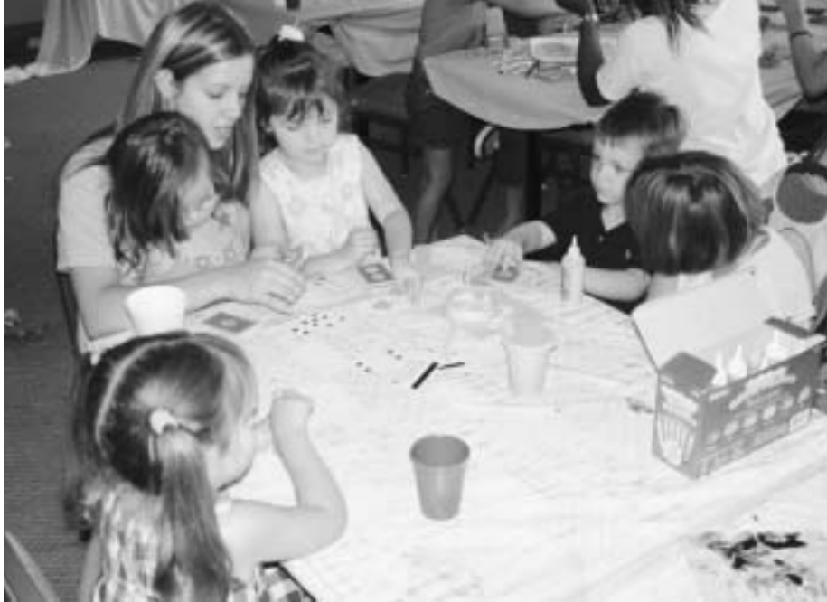
Children at the NABC child care program enjoy many activities, one of which (naturally) is playing cards. This service is popular with parents of young children, as well as the children themselves.