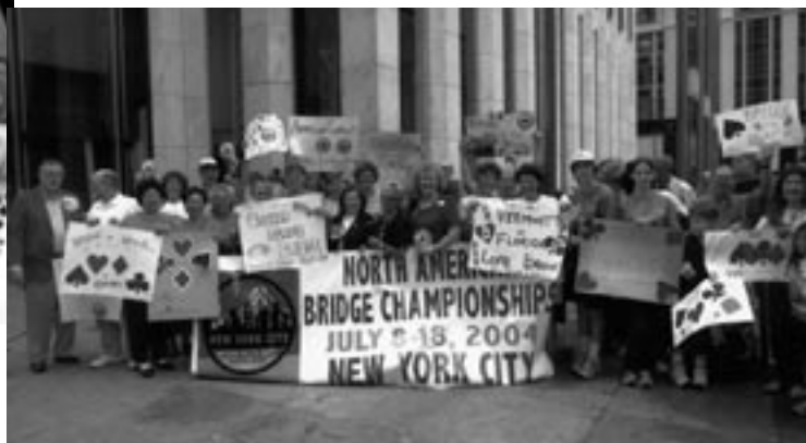
The Whole ACBL Gang