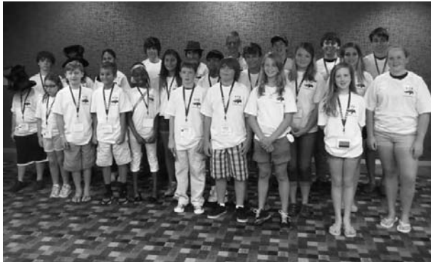
District 9 sent a huge contingent of players to the Youth NABC – 32 in all. Most of them are in the photo.