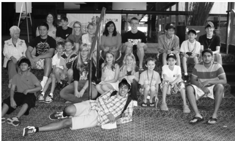
Atlanta Junior Bridge has had a huge presence at each of the four Youth NABCs, the first being held in the Atlanta area in 2008. Here are some of the Atlanta contingent in Toronto.

See you at the 2012 Youth NABC, July 19, 20 and 21 in Philadelphia. Don't miss it!