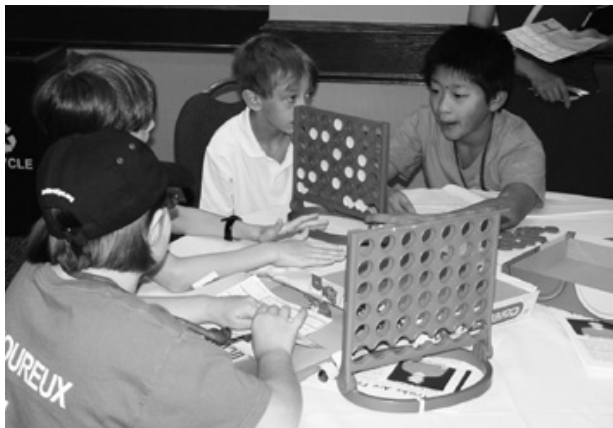
Bridge isn't the only game played at the Youth NABC. These youngsters enjoyed a game of Connect prior to the start of play on Saturday.