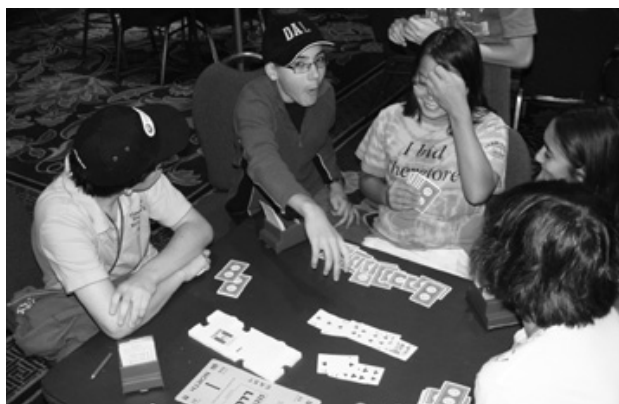
When asked what game they were playing on Saturday before the start of play, one of the youngsters said, "We don't know - maybe a messed up game of cutthroat?"