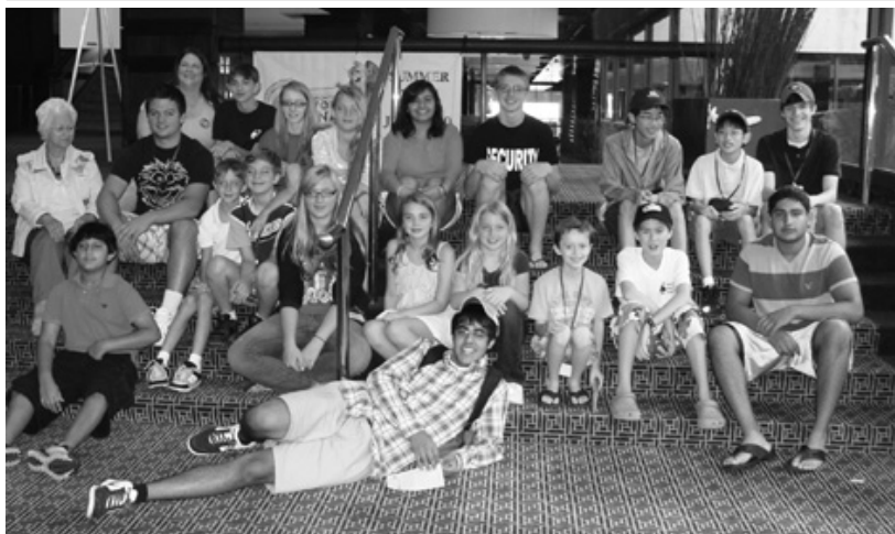
Atlanta Junior Bridge has had a huge presence at each of the four Youth NABCs, the first being held in the Atlanta area in 2008. Here are some of the Atlanta contingent in Toronto.

See you at the 2012 Youth NABC, July 19, 20 and 21 in Philadelphia. Don't miss it!