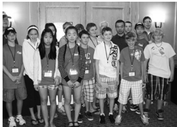
These young players came all the way from Moncton NB to play in the Youth NABC.