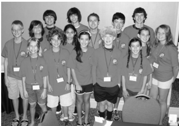
Some of the 26 young players from Florida (District 9).