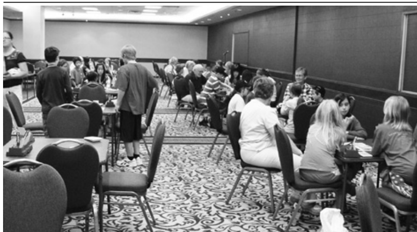
While the Youth Open Pairs was in progress, younger players were competing in the Card Rook Pairs.