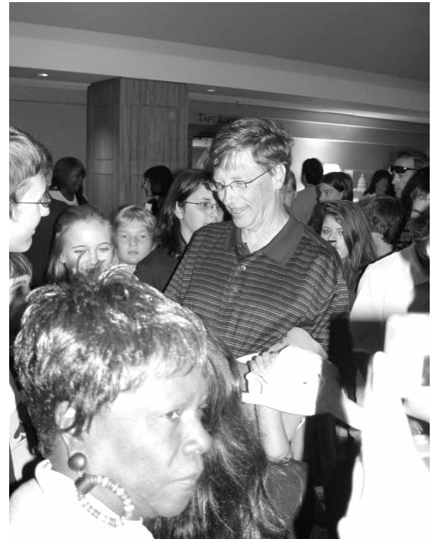
Bill Gates attracted a lot of attention when he made an appearance at the Youth NABC on Saturday.