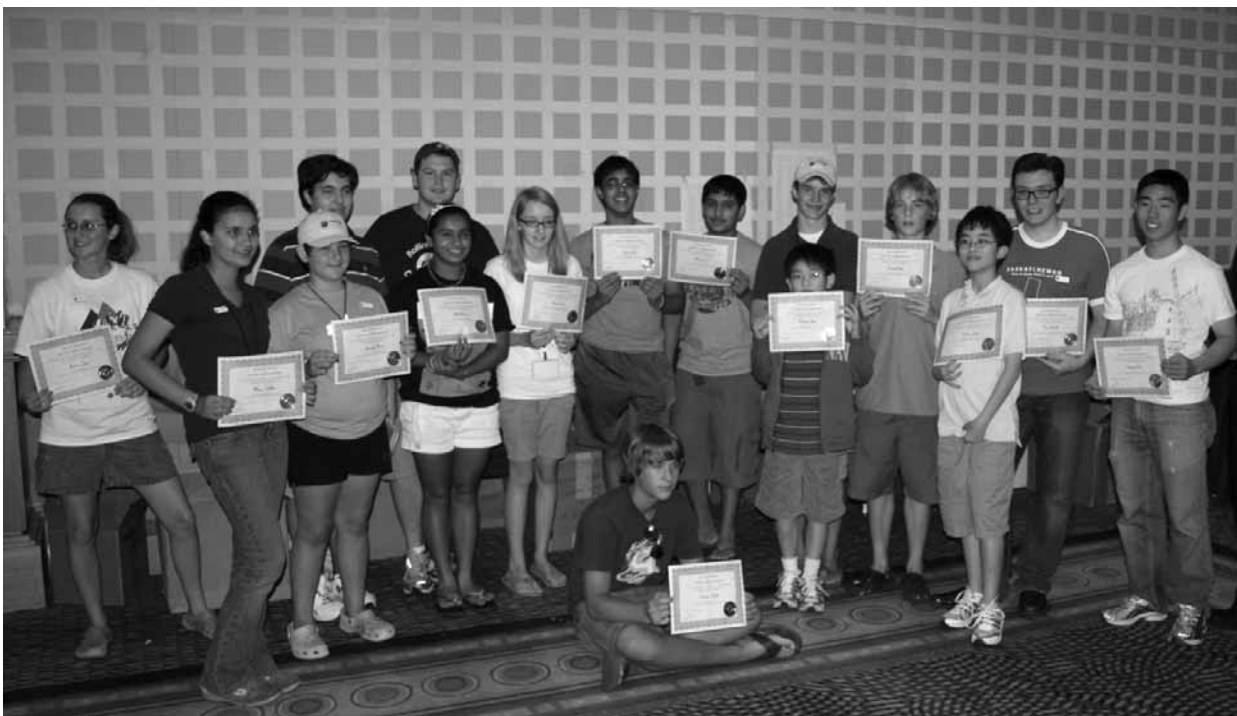
These players were named on Saturday as Youth Ambassadors. Each is nominated for the position by his or her district director for exhibiting high ethical standards, excellent sportsmanship and a passion for the game. The full list of Youth Ambassadors is on page 2.