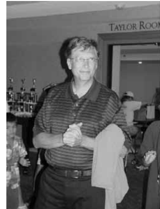
Bill Gates stopped by the Youth NABC to say hello to the young players.

Microsoft founder Bill Gates is not a rock star, but he got the rock star treatment in a surprise appearance at the Youth NABC on Saturday.