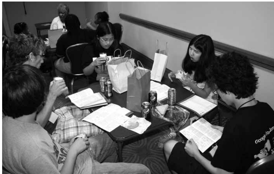
After the morning session, players check out the analysis book to see the best way to bid the hands.