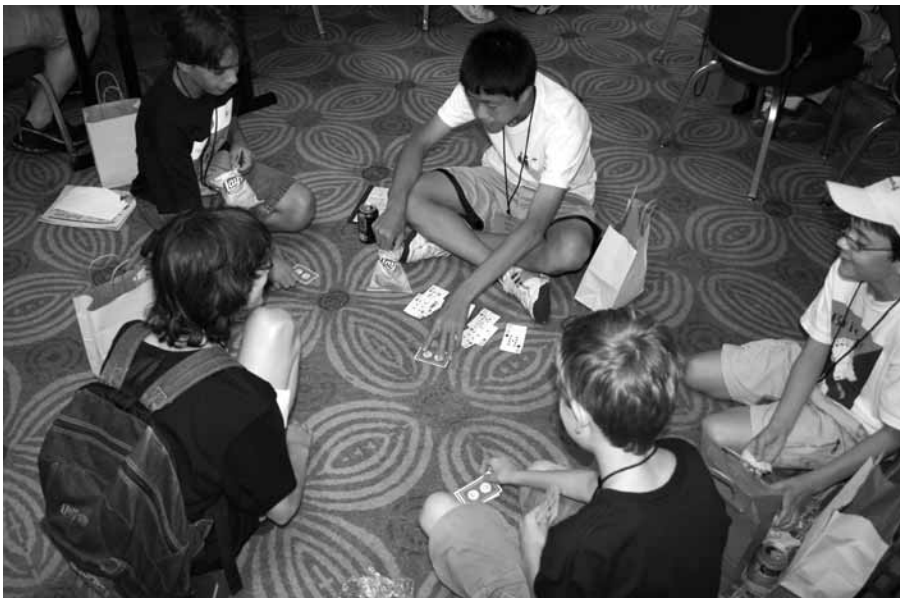
Who needs a table? These guys decided the floor works just fine for a quick hand between sessions.