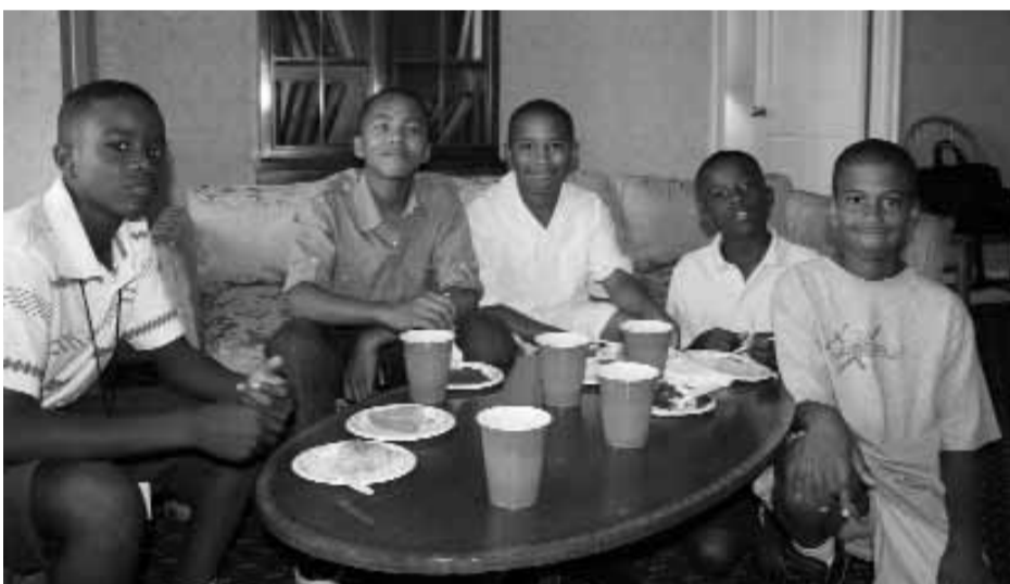
These Atlanta-area players are enjoying the food at a reception given for attendees of the Youth NABC.